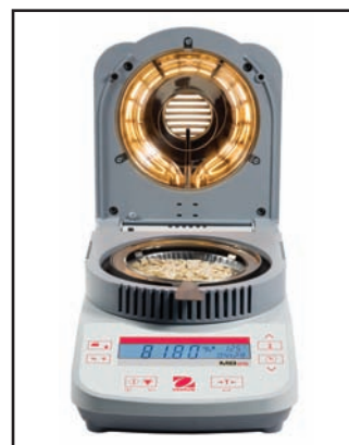
The OHAUS MB23 comes with an infrared heating element, while the MB25 uses halogen technology