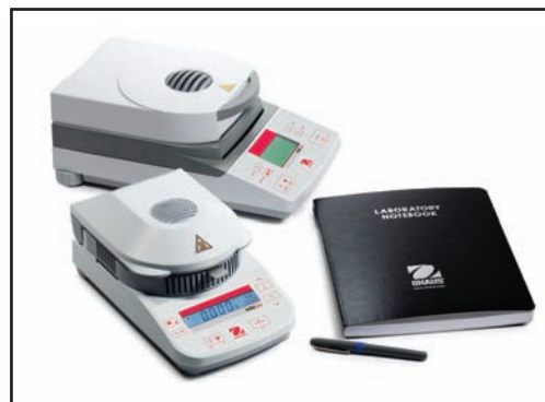
With its small footprint, the OHAUS MB23 and MB25 are compact enough to fit on any benchtop